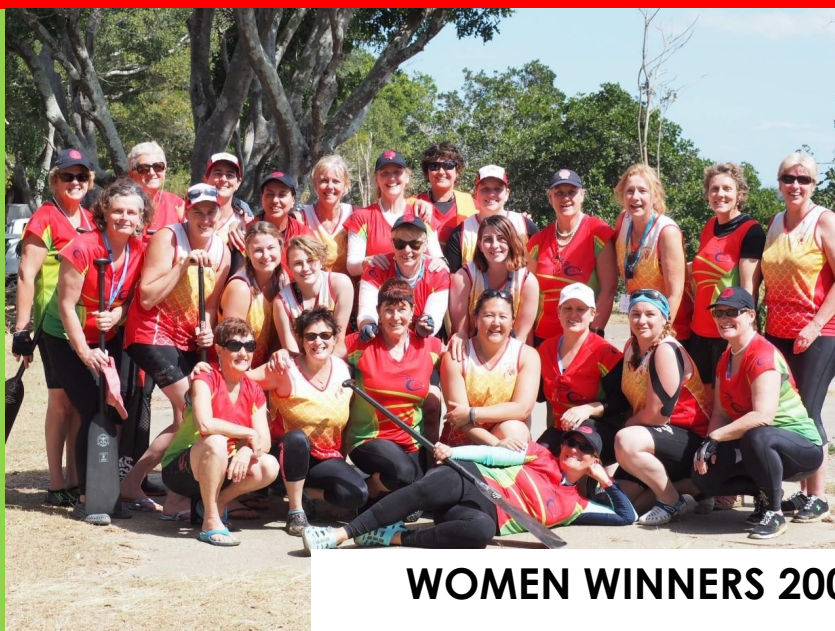
WOMEN WINNERS 200M