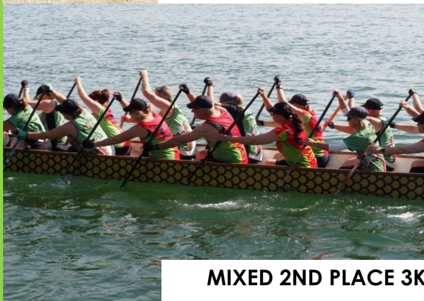
MIXED 2ND PLACE 3KMS