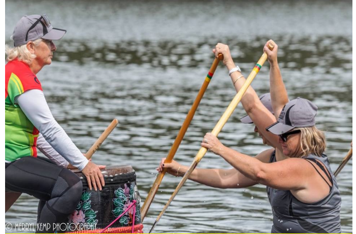
Community teams' (Snr) winners "Anna's and Lakeside" showing the value of straight arm technique!