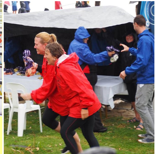
"Pretty sure they won't know we've taken all their medals!"