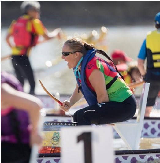
"Come oooooonnnn!!!!!! POOOOOWERRRR!!!"