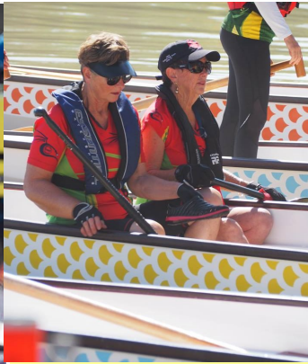
"Hold my shoe please. I've got to race now!"