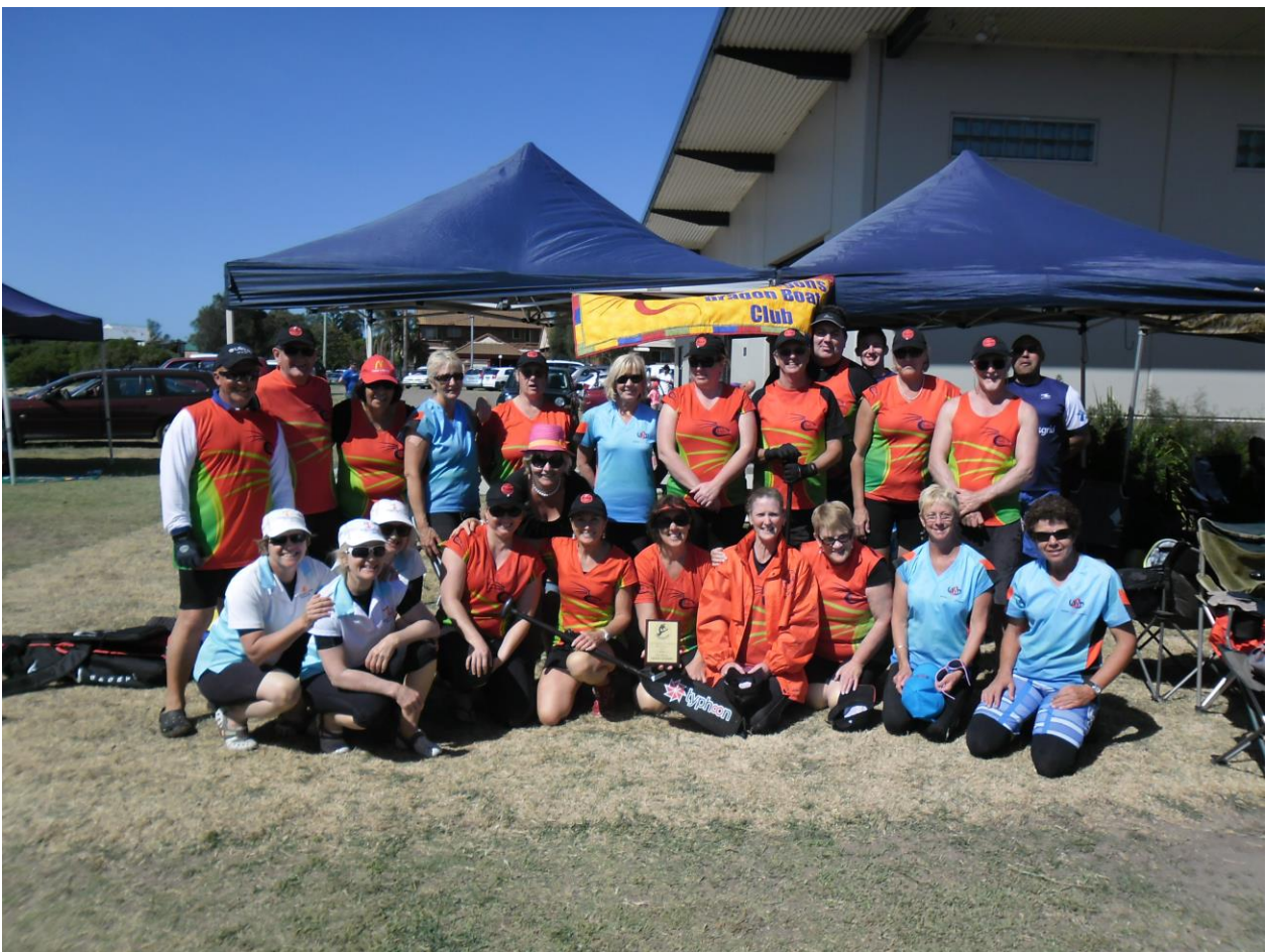
The Newcastle Regatta team

(who is that little leprechaun in the middle???)