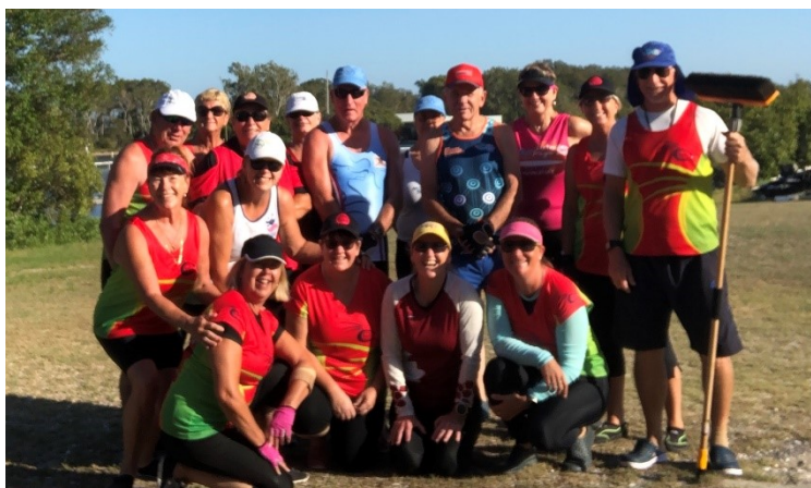
The crew of Great Lakes Pearl Dragons attending their first training session as the 'national's squad'.

Along with this crew, our club proudly also has five members participating in the regional and state representative teams.